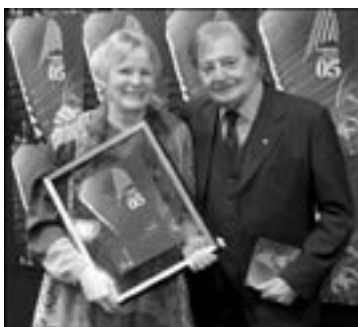
Anne Boyd, winner of the Distinguished Services to Music Award with colleague Peter Sculthorpe.