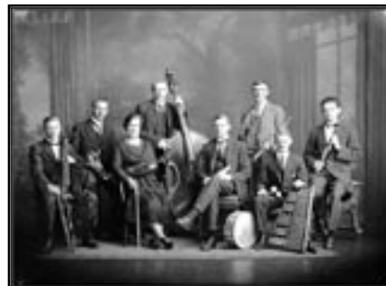
The Paramount Orchestra of Wanganui. [ca 1930].

For more information about Cadence phone +64 4 474 3017 or email: musichire@natlib.govt.nz