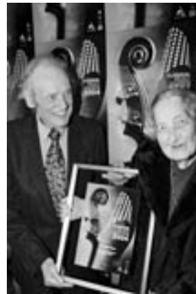
Richard Meale and Miriam Hyde

The annual APRA – Australian Music Centre Classical Music Awards pay tribute to those individuals and organisations that