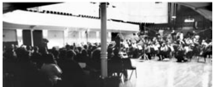
The orchestra and audience during the final read-throughs in the Wellington Town Hall.