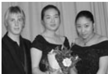
The Ahi Trio