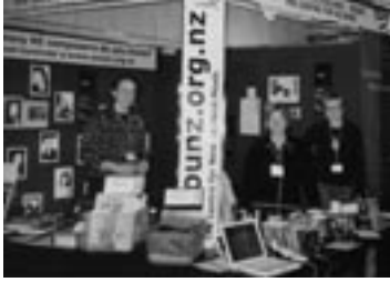
The SOUNZ stand

At the end of August, SOUNZ shared a trade stand with Creative New Zealand at the Music Expo held at the Sky City Convention Centre in Auckland. While the emphasis was on trade of hifi and industry standard sound gear, the Expo drew in musicians with all sorts of backgrounds and interests and it was a rare opportunity for our Auckland friends to see SOUNZ wares usually only visible on our website or through our library service. It was also great for SOUNZ to meet representatives from other related organisations, APRA, RIANZ, NZ on Air, the Music Industry Commission and Independent Music NZ.