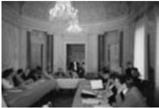
The conference venue.

In July, SOUNZ had trade stands at both the New Zealand Association of Teachers of Singing (NEWZATS) conference in Palmerston North and the Australian Computer Music Conference, held at Victoria University. There was huge interest in music by NZ composers conveyed at both events.